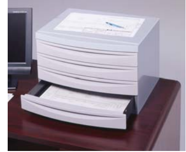
Single #4945LG on desk top