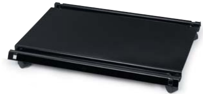
Removable, Optional #4946BL Caster Base