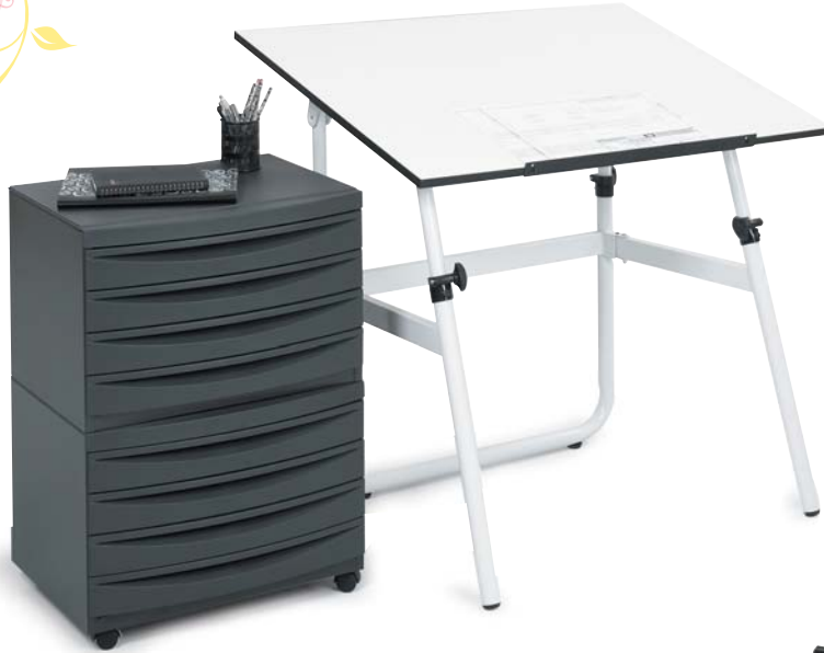
Shown with two #4945CH stacked, optional #4946BL Caster Base. Units stack maximum 2 high.